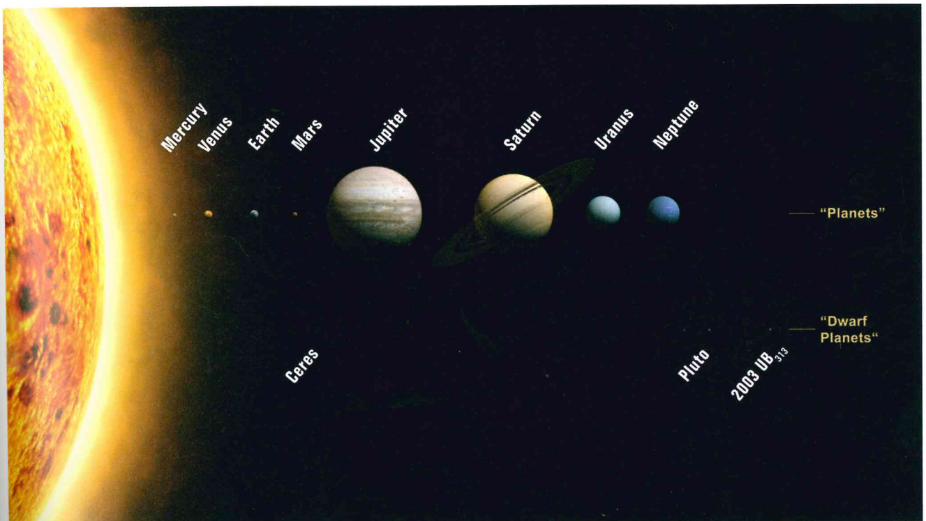
The worlds in our solar system (diameters to scale, distances between planets not to scale)