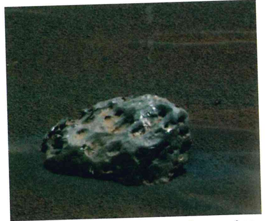
Figure 1-6: Photograph of a meteorite—the name given to a meteoroid once it has landed on a planet—found on the surface of Mars