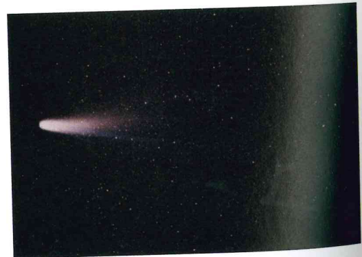
Figure 1-8: Photograph of Comet Halley