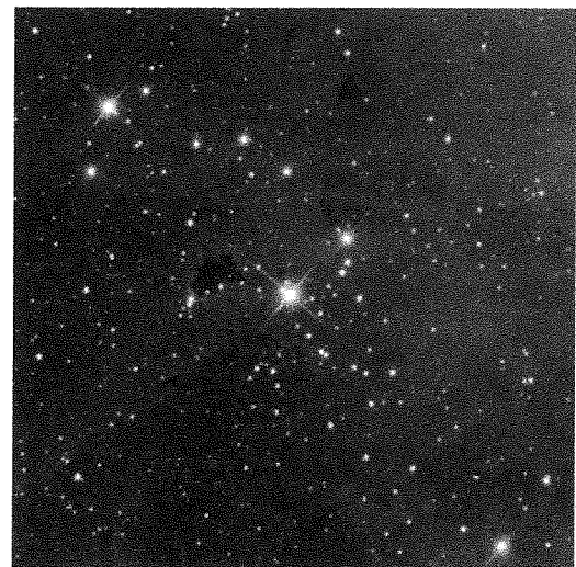
Figure 2-11: Image of a cluster of stars in Centaurus about 5900 ly from Earth. How bright a star appears to be in the night sky depends on both the star's diameter and its distance from us.